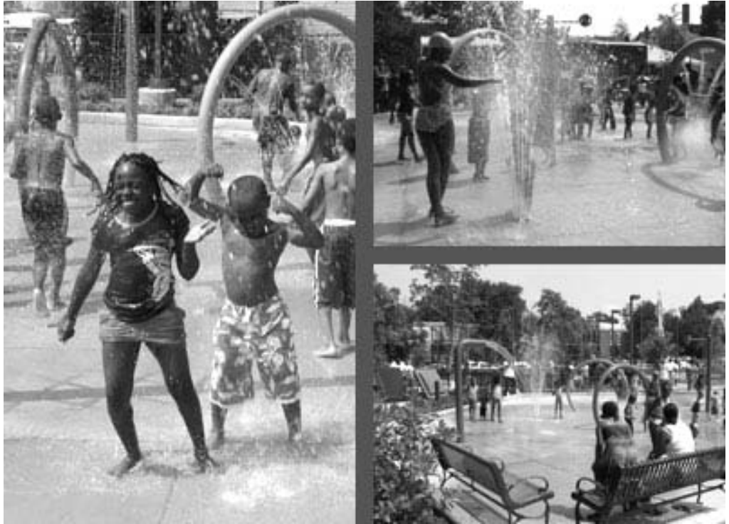
Lee & Associates

Residents and visitors are encouraged to find a cooling center near you.